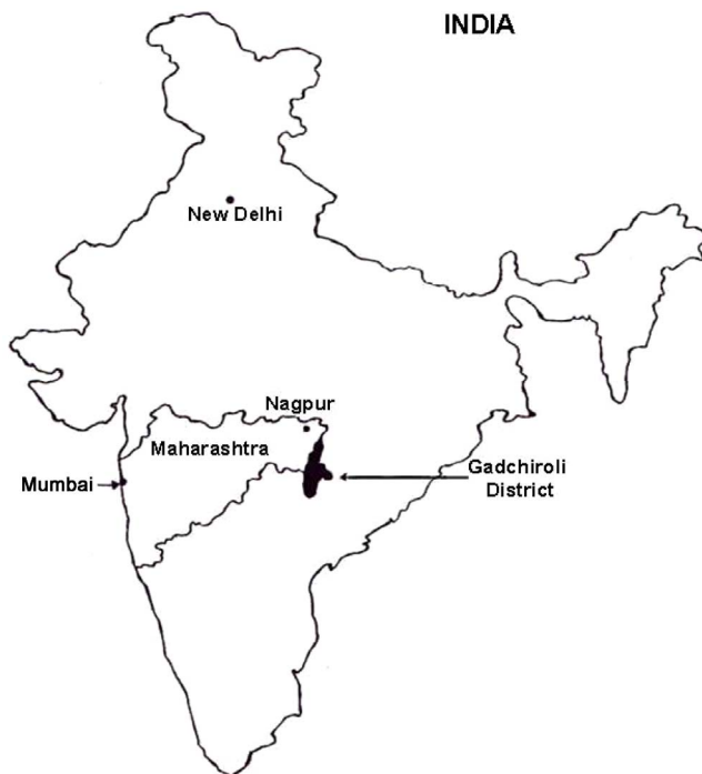
Figure 1. Gadchiroli District, Maharashtra State, India. doi:10.1371/journal.pone.0081966.g001

Healthcare is provided in this district by government facilities, which include one district hospital, 12 rural hospitals, 45 primary health centers and 376 primary health units [7]. The NVBDCP is implemented in the district by District Malaria Officer (DMO), with physicians stationed at the Primary Health Centers (PHCs), and community health workers (CHWs) who travel to villages to provide testing, treatment, and distribution of malaria chemoprophylaxis. Rapid diagnostic tests are available in some areas, though in most regions malaria testing is done solely with blood smear slide microscopy.