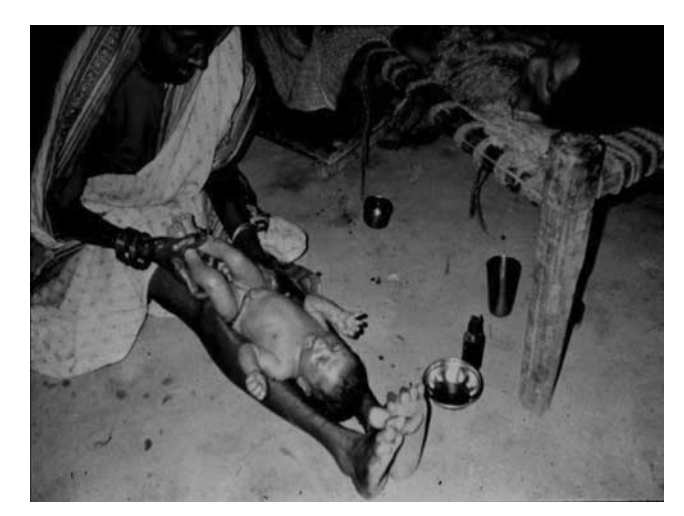
Figure 4. Home delivery room and newborn care.

Birth preparations did not include provision for seeking emergency medical care.